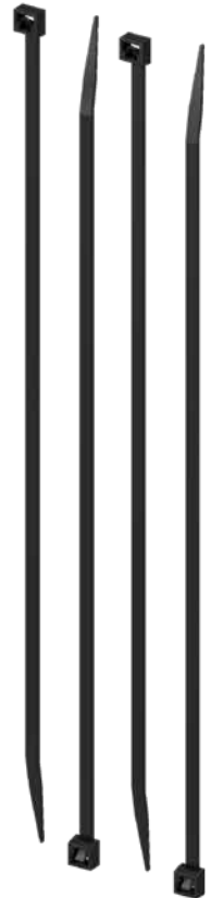
4 x Zip Tie