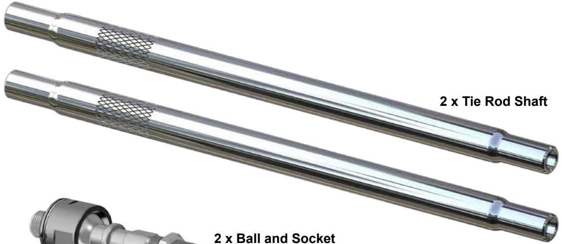
2 x Tie Rod Shaft