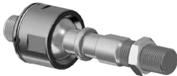
2 x Ball and Socket